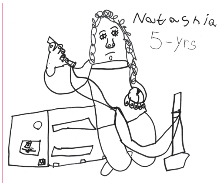
Natasha's drawing of the bridge: various representations expand a child's abilities

Throughout these adventures you and the children are co-creating knowledge through a give-and-take that honors the children as competent learners and you as integral to their process and progression in building knowledge. Through these thoughtful and purposeful activities you are helping them to more than know ; you are helping them add to a store of knowledge .